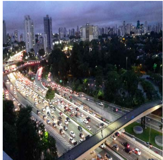
São Paulo by night