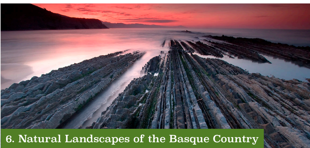
6. Natural Landscapes of the Basque Country

In Basque, curiosity is jakinmin , which translates as pain for knowing .