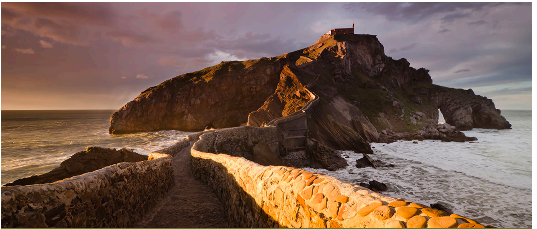
1. Pre-indoeuropean and isolated language, one of the oldest languages still alive