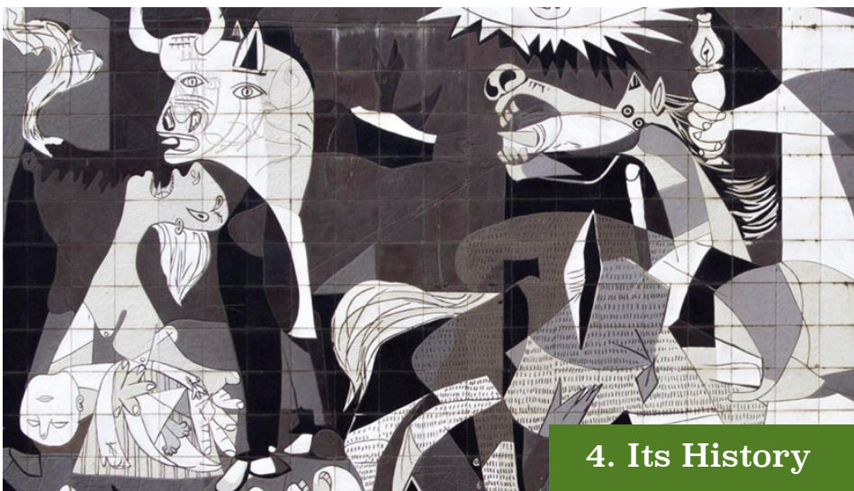
4. Its History