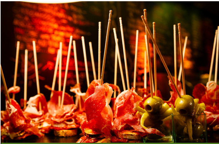
2. Basque Gastronomy, pintxoak