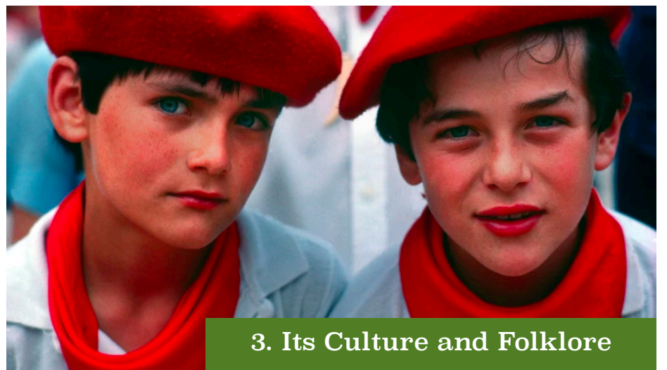
3. Its Culture and Folklore